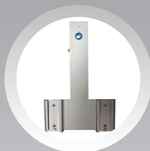
Dual Canister Bracket