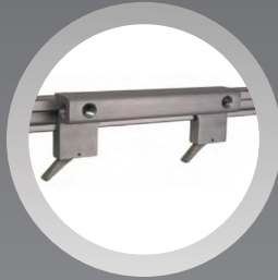
Double Gas Block Available with choice of fittings