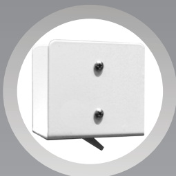
Aneroid Cuff Holder