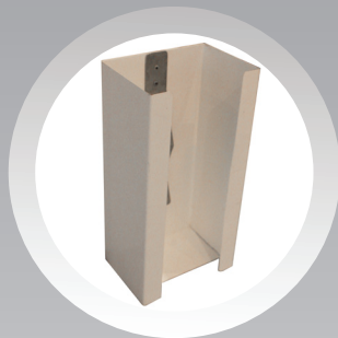
Glove Box Holder