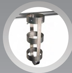
Oxygen Cylinder Holder