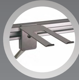
Resuscitation Bag Holder