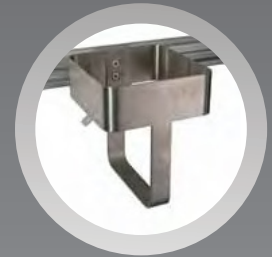
Sharps Container Holder