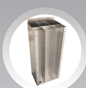
6 Slot Catheter Holder