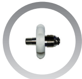
CGA992 (BS) Handtight